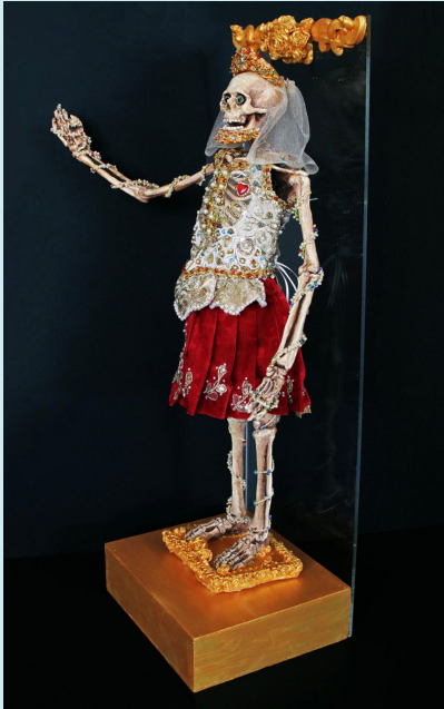
Katakombenheiligen (St. Severin)

Additional information will be provided when available via e-blasts. THANK YOU FOR YOUR COOPERATION.