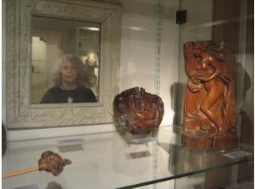
Self-portrait taken at the Maillol Museum in Paris