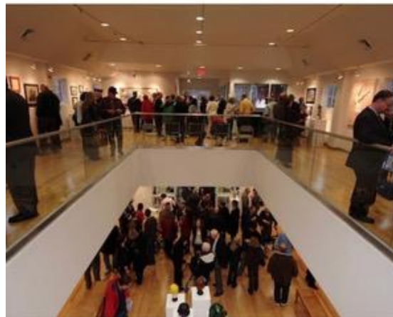
ART LEAGUE OF LONG ISLAND

Next year our onsite show will be exhibited in the beautiful gallery at the Art League of Long Island in Dix Hills, New York for three weeks in the fall. The Art League is a highly regarded art learning center with classes in several mediums. Their cherished building is highlighted by an exquisite double-tiered exhibition gallery. The public will be invited to see our Exhibition as well as the Art League student body, faculty, and friends. Our members' artwork will be viewed by many outside of our Audubon Artists membership.