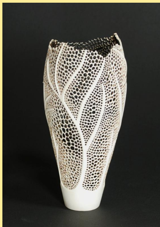
Nature's Lace by Buren Gilpin

Mikhail Gubin's solo exhibition, Geometry is on display at the