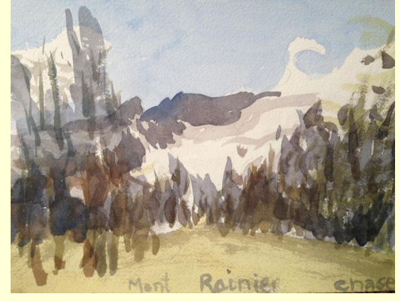
Mount Rainier, Washington, from Sunrise vista, summer of 2014

acknowledged in our Newsletter and on our Website. Again, we thank all our donors.