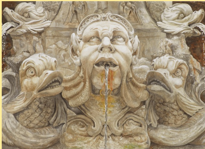
Fontana Del Pantheon