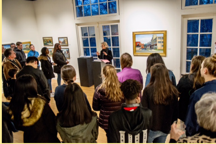
Artist talk, Stony Brook Carson Gallery