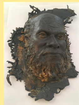
Old Man Redux