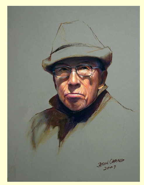
Man with Hat