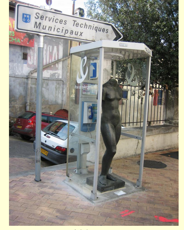
Adolescence by Charles Despair Mont-De-Marsan