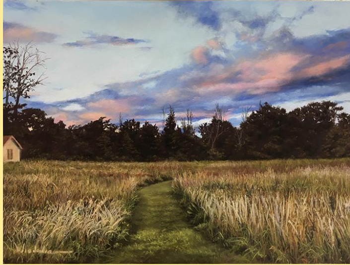
Sunrise on the Studio, pastel, 18"x24"

Visit her website at www.wiedenbaum.com .