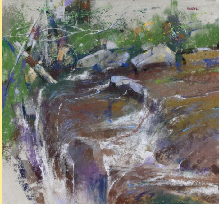
Over the Edge

Theresa Troise Heidel's paintings were shown in the Upper Gallery of the Spring Lake Community House in NJ from Aug, to Nov. of 2019. The exhibit, "The Magic of Light" featured many of her watercolors completed on location at the NJ Shore, Maine, the Adirondacks, France, England, Canada and Italy.