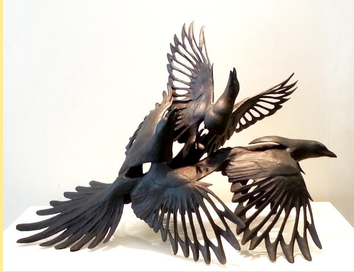
Mischief and Plunder

In October 2019 the Ocean County Artists Guild in Island Heights, New Jersey presented an exhibit of hand pulled original prints by members of their own Printmaking Club. Fifty linocut prints by ten artists were on display.