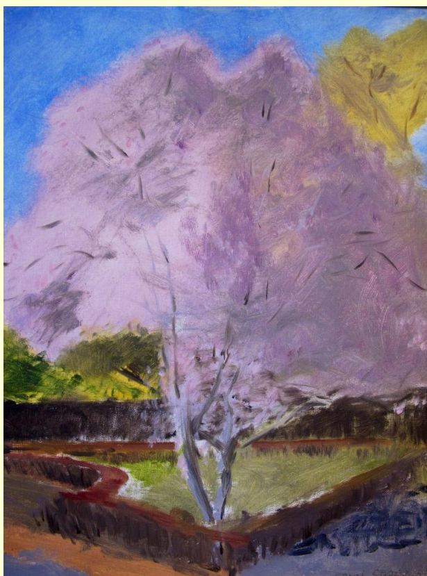
Pink Magnolia Tree, Brooklyn Botanic Garden, summer of 2013.