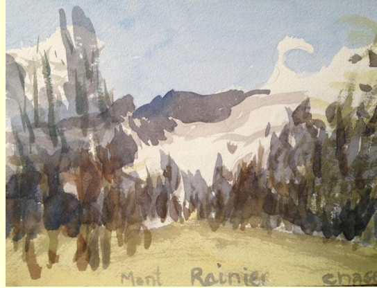
Mount Rainier, Washington, from Sunrise vista, summer of 2014

acknowledged in our Newsletter and on our Website. Again, we thank all our donors.