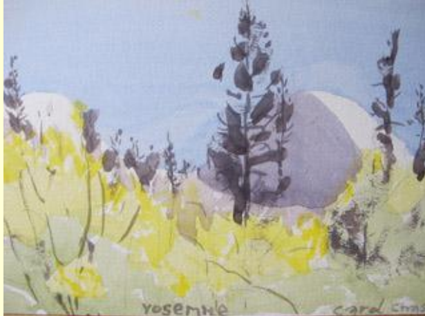
El Capitan, Yosemite National Park, summer of 2012